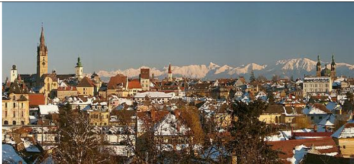
Panoramic view of the city of SIBIU