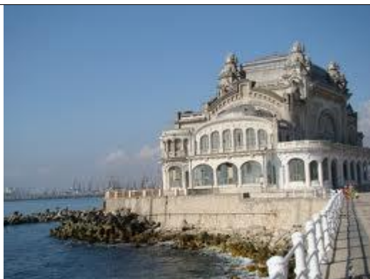
The city of CONSTAN A, by the Black Sea

In Romania, the most frequently used mean of transportation is the train. There are also buses between cities.