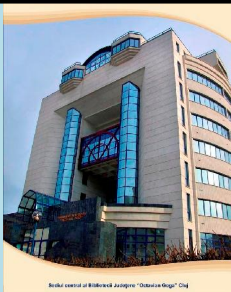
Sediul central al Bibliotecii Județene "Octavian Goga" Cluj